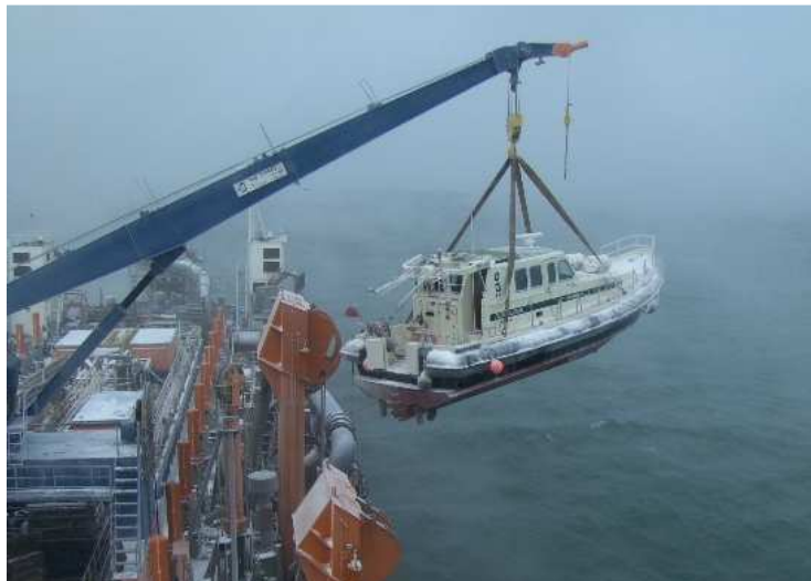
Fast and easy mobilisation

Contact: loots@geoplus.nl or phone +31(0)6 55 73 59 59 http://www.geoplus.nl